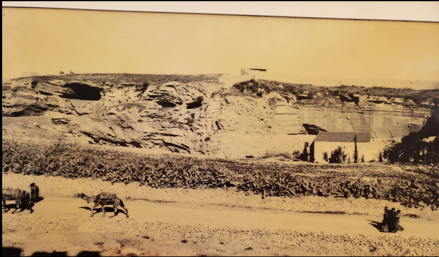
Place of the Skull